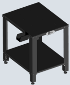
TAB-98 LITE Support table.